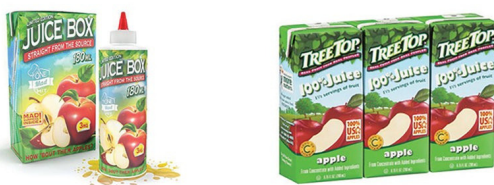
FDA, FTC warn companies to stop misleading kids